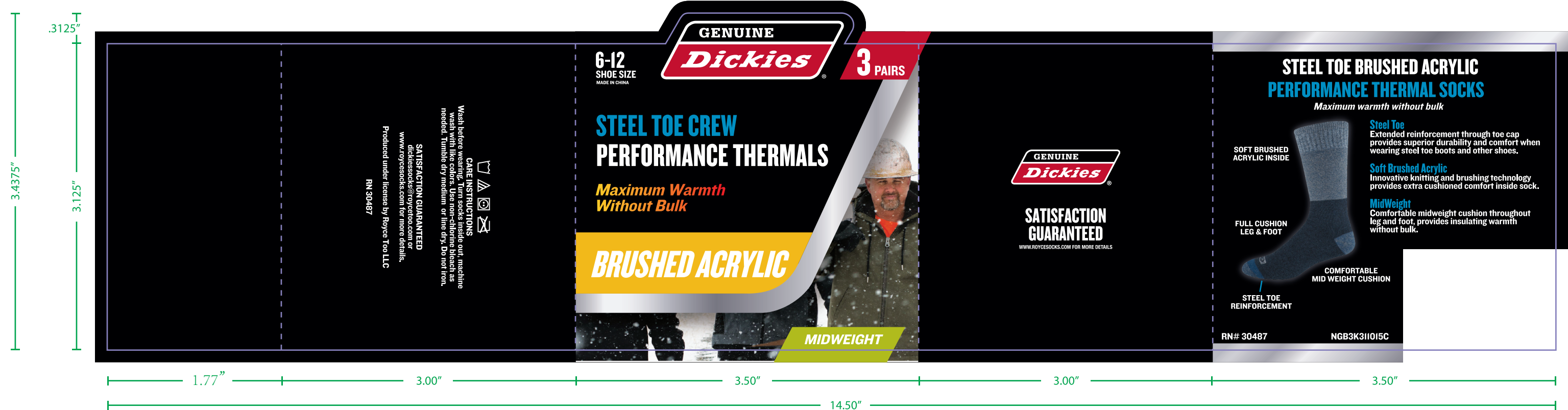
Printed Side Up