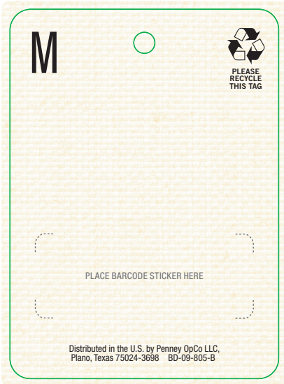
(Back) SKU 3: 50 pcs