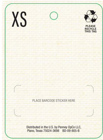
(Back) SKU 7: 50 pcs