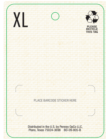
(Back) SKU 11: 50 pcs