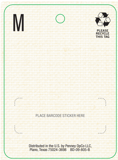
(Back) SKU 9: 50 pcs