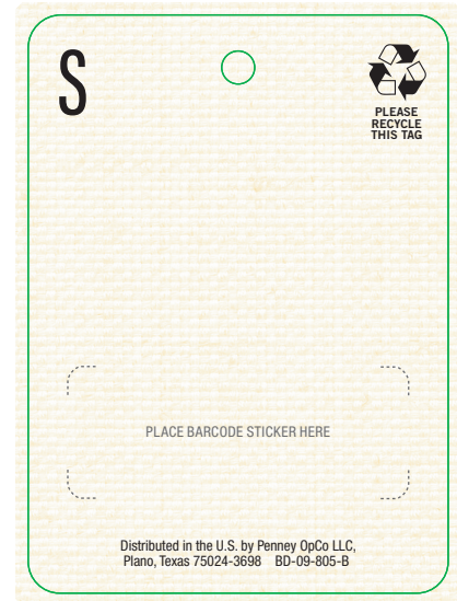
(Back) SKU 8: 50 pcs