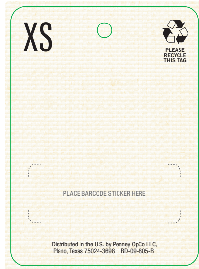
(Back) SKU 13: 50 pcs