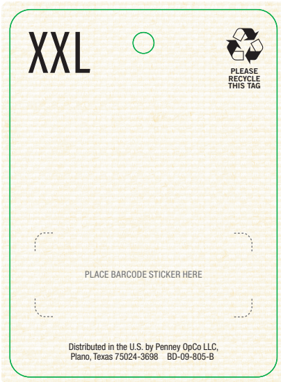
(Back) SKU 6: 50 pcs

AD Order: ADNL-NRFMBN | Item code: BD-09-805-B-COM | AD GLID: 1-285466-000-01 | GPM Id: G1335049313 Version: "vcs:V:10//PROD/ticketProjects/JCPE_J C PENNEY/.../variablePanels/JCPE_J C PENNEY/DW00536_0001.wfd"