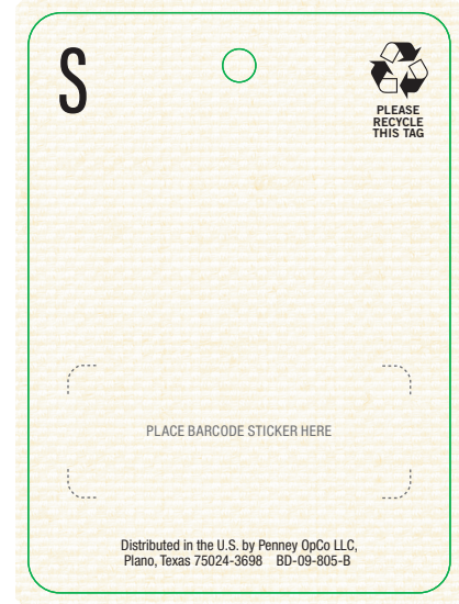
(Back) SKU 2: 50 pcs