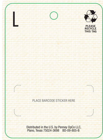
(Back) SKU 4: 50 pcs