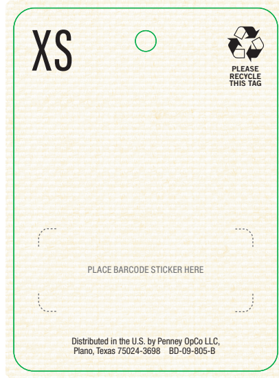
(Back) SKU 1: 50 pcs