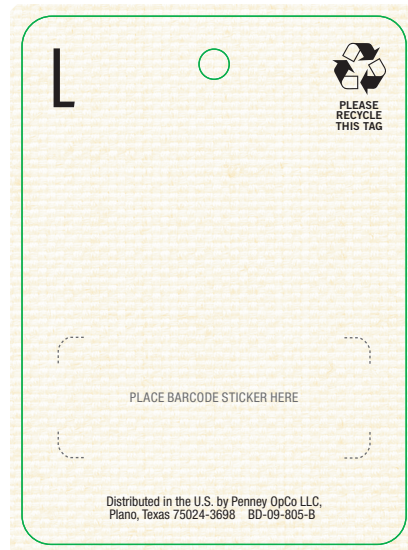
(Back) SKU 16: 50 pcs