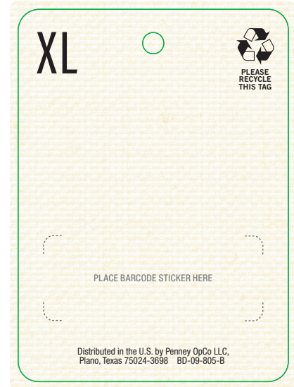
(Back) SKU 5: 50 pcs