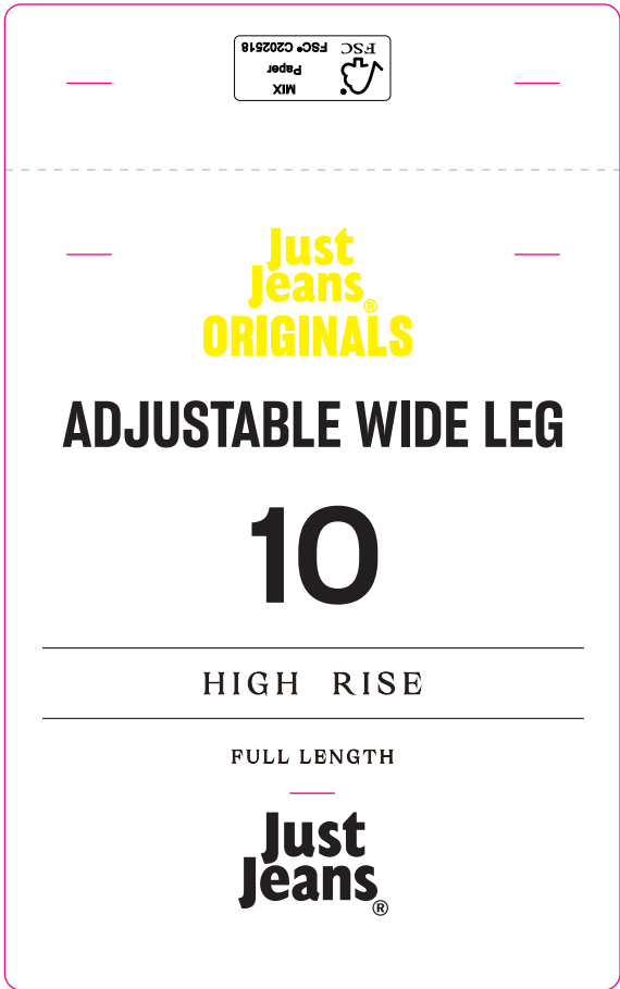
Back Pocket Tag W-75mm X H-120mm