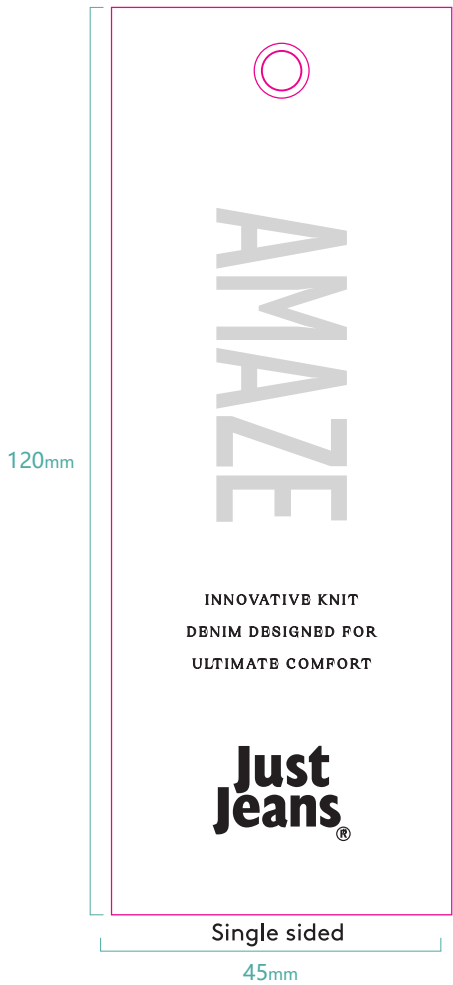
AMAZE SWING TAGS 45mmx120mm JJW-AM-IT-001