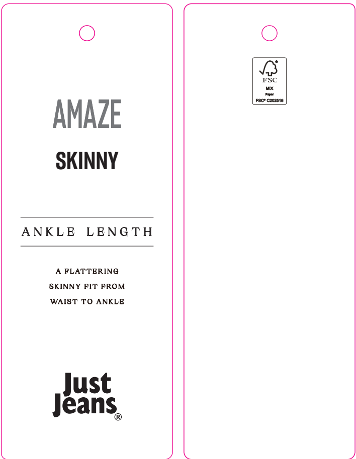
AMAZE PRODUCT TICKET 45X120mm JJW-AM-ST