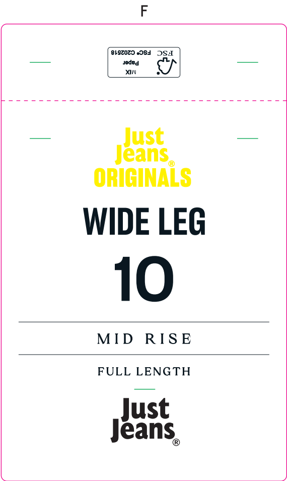
JJW-OR-PT Originals_Back Pocket Tag 75mm X 120mm