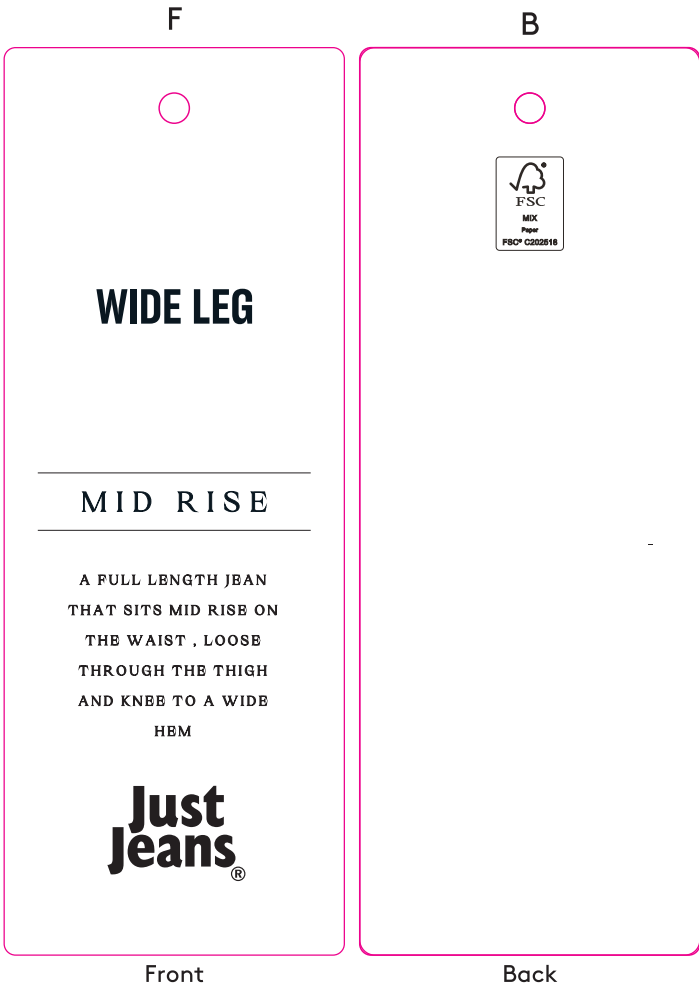
JJW-OR-ST Originals_Product Swing Ticket 45mm X 120mm