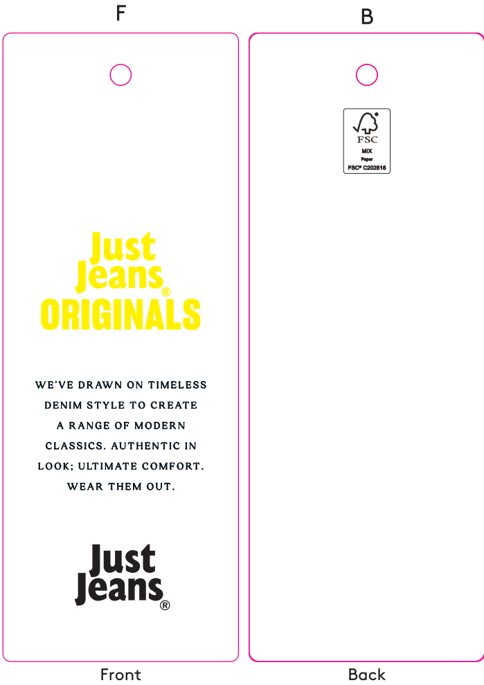
Original JJW-OR-IT-001 45x120mm