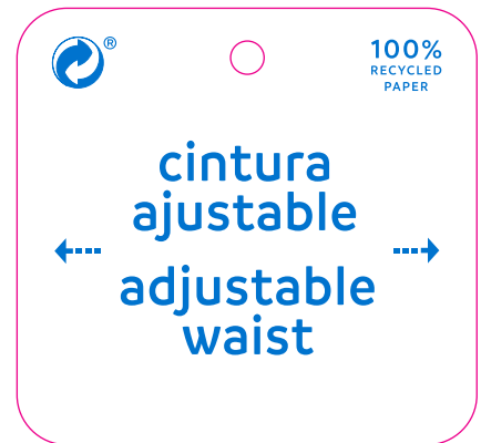
Shiro Echo Bright White 300 gr