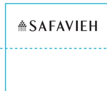
Woven Label Top Sew - DEFAULT SIZE: 1.75" (W) × 1.5" (H)