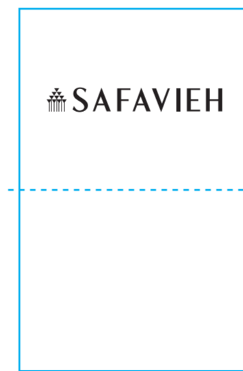
Woven Label Top Sew - LARGE SIZE (For Textured and/or High-Pile Fabrications): 1.75" (W) × 2.75" (H)

Brand Label Type: top sew Material: Woven Special Techniques: