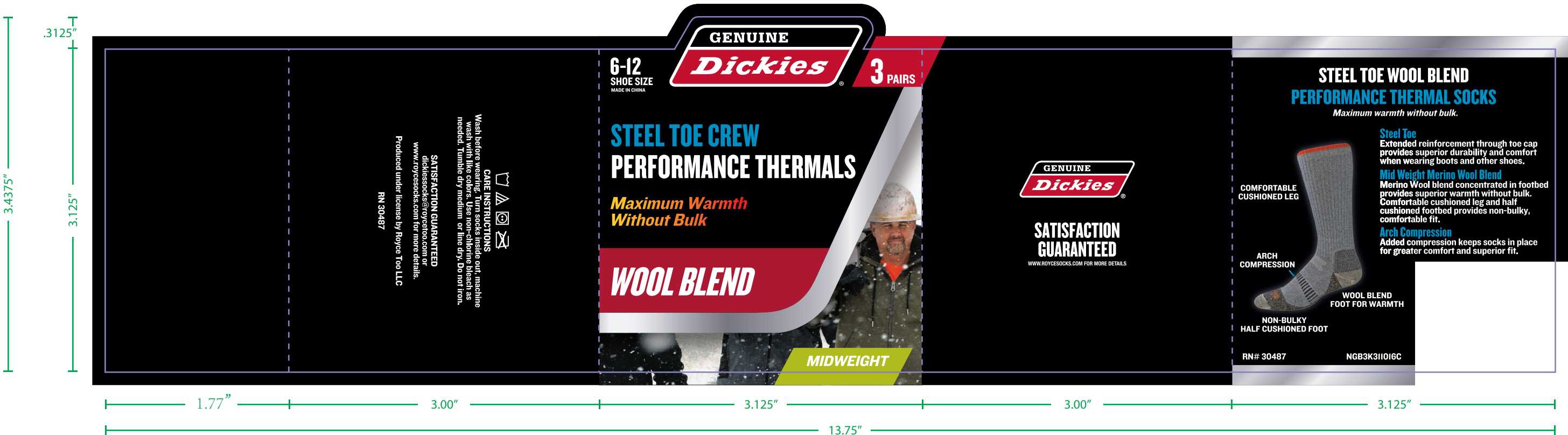
Printed Side Up